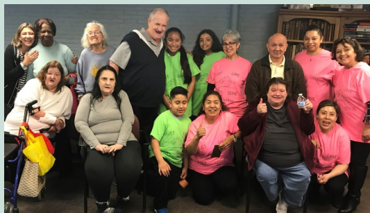
PEP volunteers, pictured in pink and green tee shirts, gathered for a photo with the Scofield residents.

The Scofield Manor residents and staff are thankful to the PEP group for bringing the gifts of joy, sunshine and springtime into their building!