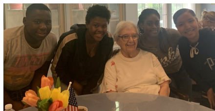
Turn of River Middle School students share in a photo with a Wormser resident.

The Wormser Congregate residents and staff look forward to continuing a partnership with the Turn of River Middle School students.