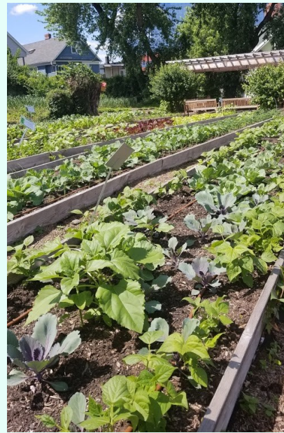
An abundance of organic produce will be ready for harvest throughout the summer months at Fairgate Farm.

Strawberries ripen in June, and in July the farms explode with produce, especially raspberries, blueberries, peaches and sweet corn. In August, the pepper and tomato crops are ready, and as summer comes to a close in September, pumpkins and seasonal squash are ready in plenty of time to welcome autumn.