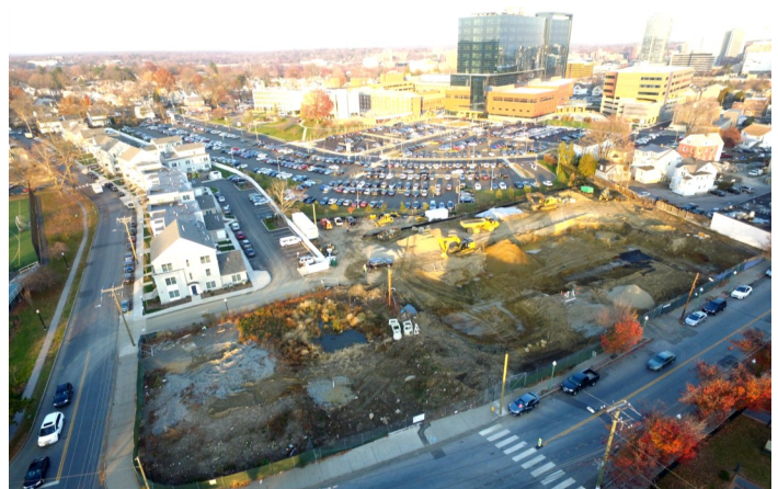
Future site of Park 215, located on Stillwater Avenue at the corner of Merrell Avenue.