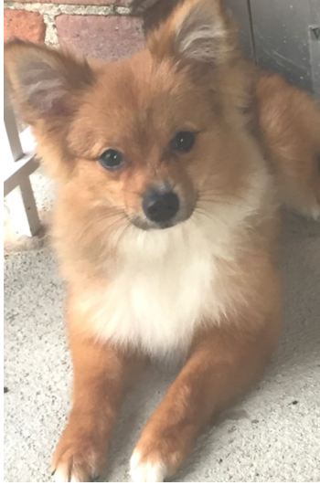
Riley pauses in his playing just for a moment to pose for the camera.